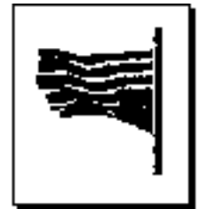
Nation in Distress

Frontiersman 435 South White Road San Jose, California 95127 Produced at Mere Keep