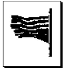
Nation in Distress