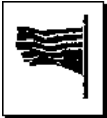
Nation in Distress