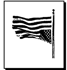
Nation in Distress

Frontiersman 435 South White Road San Jose, California 95127 Produced at Mere Keep